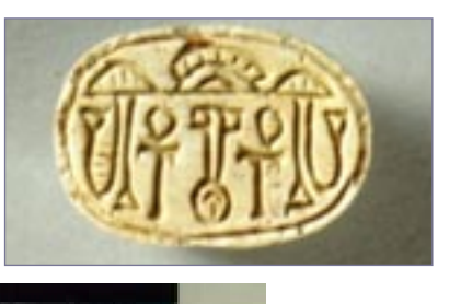
Date: MB IIB 68 Excavation number: S/4604/6037/SQ. 23 Material: steatite