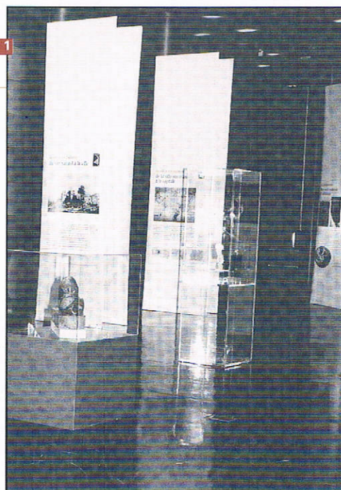
1-2-3. View of exhibition at the Institut du Monde Arabe.